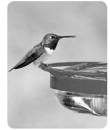
WBU High Perch Hummingbird Feeder