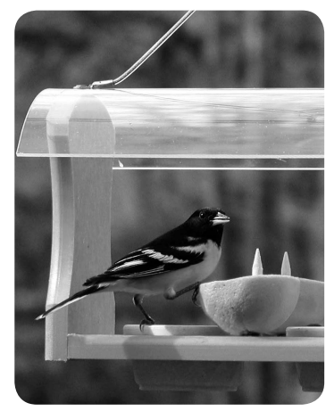
Recycled Oriole Feeder